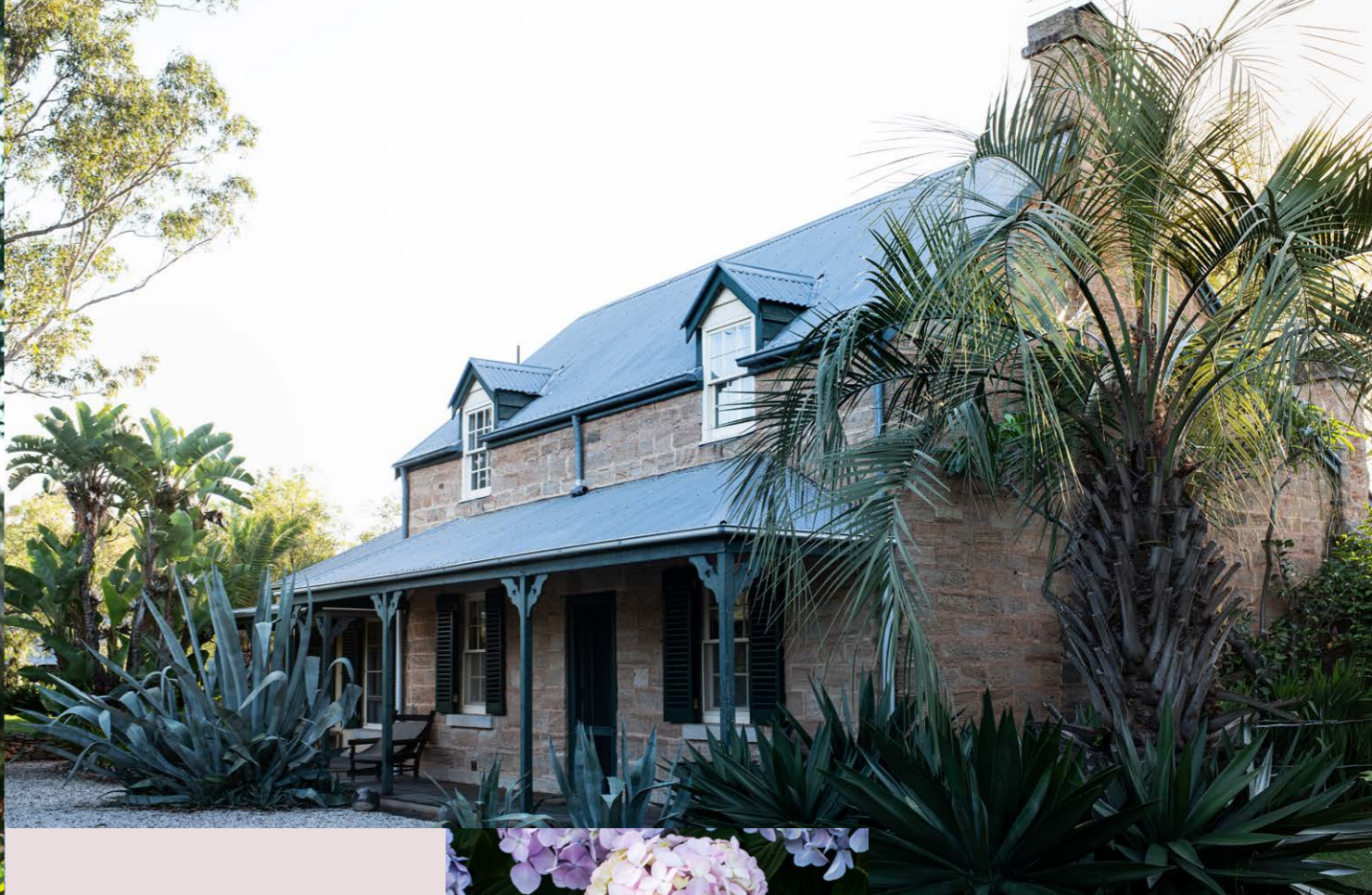
CLOCKWISE, FROM LEFT "Each area in the garden has a different ambience," says Mickey; agave plants, which hark back to colonisation, flank the house. "I decided that the plants here needed to be handsome rather than pretty. I felt we needed to anchor the house in the time in which it was built," says Mickey; pastel petals; a bell on the barn; a serene spot to catch the morning sun; freshly cut roses; bronze flax and Russian sage.