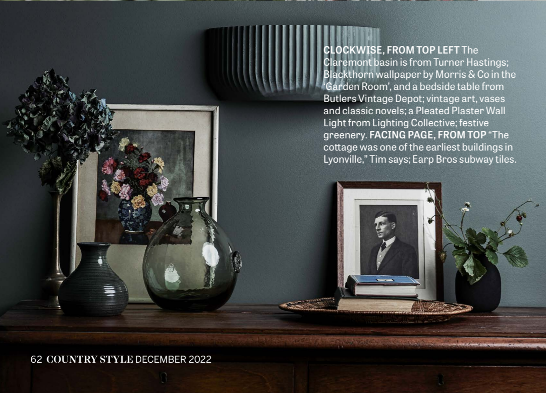
CLOCKWISE, FROM TOP LEFT The Claremont basin is from Turner Hastings; Blackthorn wallpaper by Morris & Co in the ‘Garden Room’, and a bedside table from Butlers Vintage Depot; vintage art, vases and classic novels; a Pleated Plaster Wall Light from Lighting Collective; festive greenery. FACING PAGE, FROM TOP “The cottage was one of the earliest buildings in Lyonville,” Tim says; Earp Bros subway tiles.