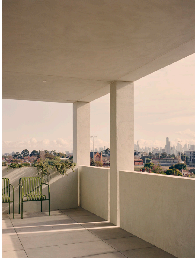
The architectural language is heightened through soft greys and muted tones, which elongate the view.