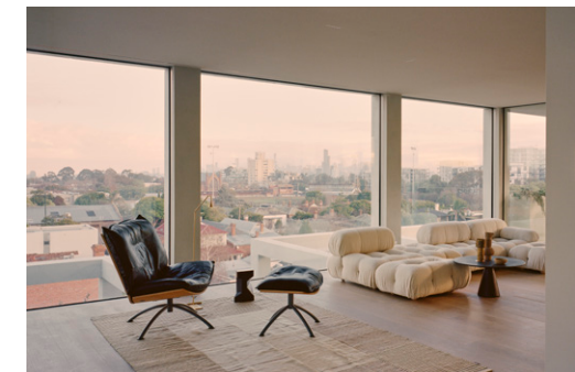
The internal spatial arrangements are shaped by Carr's desire to provide access to views and ventilation.