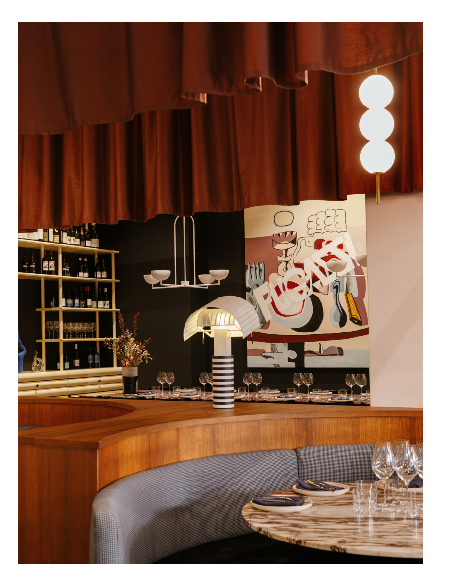
Fugazzi exemplifies a playful sense of familiarity and nostalgia while still feeling fresh and contemporary.